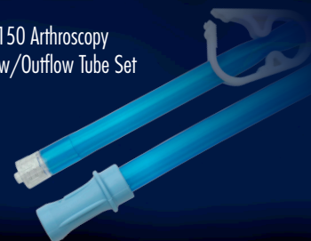
10k150 Arthroscopy Inflow/Outflow Tube Set