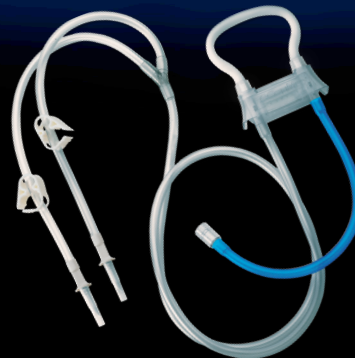
10K600 Eco-Flow™ Day-use Tubing Set