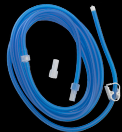
10K605 Eco-Flow™ Single-use Patient Tubing