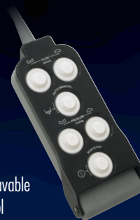
C7115 Autoclavable Remote Control